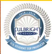
Fourteen UMBC students and recent alumni receive Fulbright awards, setting new record